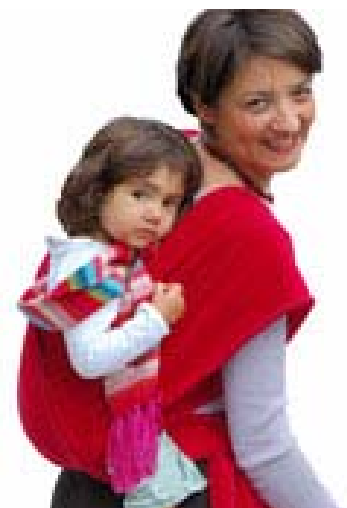
Back carry - Calin Bleu wrap

Stretchy wraps such as the Kari-me and Hug-a-bub are easier with a newborn, whereas woven wraps (Girasol, Calin-bleu) are more supportive for a heavier child.