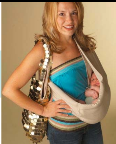
Cradle carry - Hotslings pouch