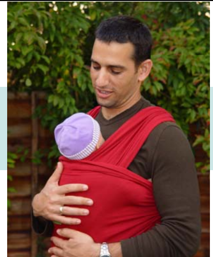
Tummy to tummy - Kari-me wrap