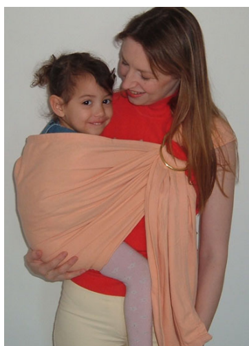
Hip carry - Natya ring sling