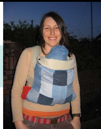
Tummy to tummy - Cwtshi

Padded ring slings (Huggababy and Better Baby) are easier to learn, but an unpadded ring sling, such as a Taylormade, Natya or Zolowear allows for greater adjustability and more versatility.