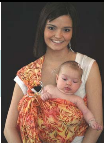
Kangaroo carry - Taylormade

Non-adjustable pouches include the Brightsparks Coorie Pouch and the Hotslings. Other pouches come with zips or poppers to give more adjustability (Zolowear Adjustable Pouch).