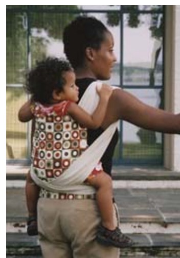
Back carry - Ellaroo Mei Tai