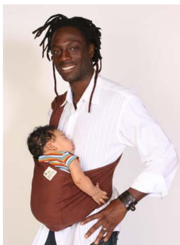
Tummy to tummy - Zolowear pouch

Covering a wide range of different carriers, the asian baby carriers include the mei-tai (Cwtshi and Ellaroo) with waist straps. More structured related soft pack carriers include the Ergo and Wilkinet.